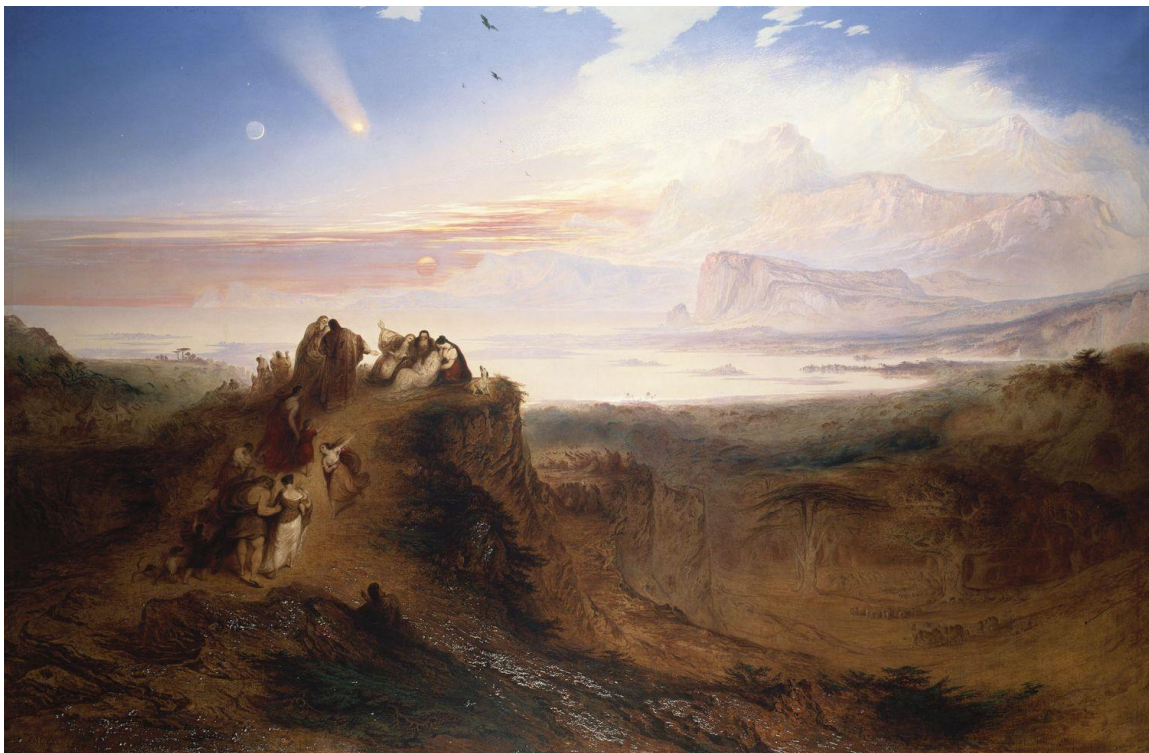
The Eve of the Deluge , by John Martin, 1840. Depicts a comet causing the Great Flood.